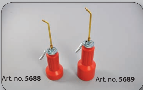
Art. no. 5688