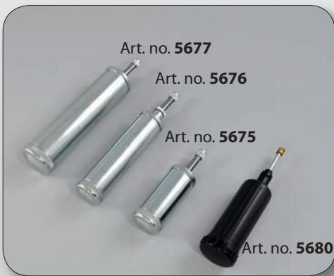
Art. no. 5677