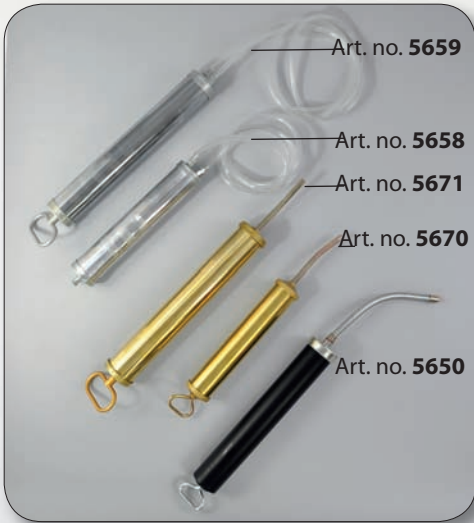
Art. no. 5659